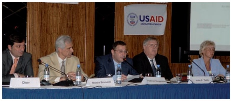
Opening session of the 7th General Meeting of the Anti-Corruption Network for Eastern Europe and Central Asia (ACN). Tbilisi, Georgia, 25 June 2008.

The Tbilisi meeting represented the first time that an ACN member country hosted the General Meeting, and participants were interested to hear about Georgia's significant progress in fighting corruption during recent years. Plenary and thematic sessions included: international anti-corruption instruments and related monitoring mechanisms;