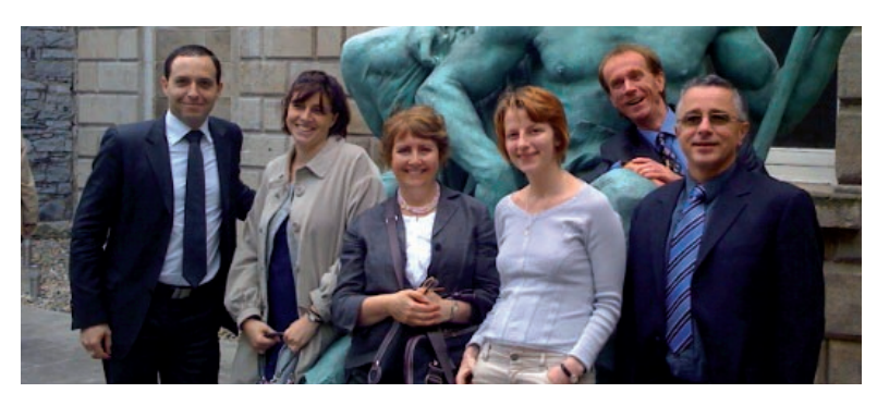
Examination Team for the Phase 2bis on-site visit to Ireland.

require the country to make regular progress reports detailing its efforts to rectify a specific problem.